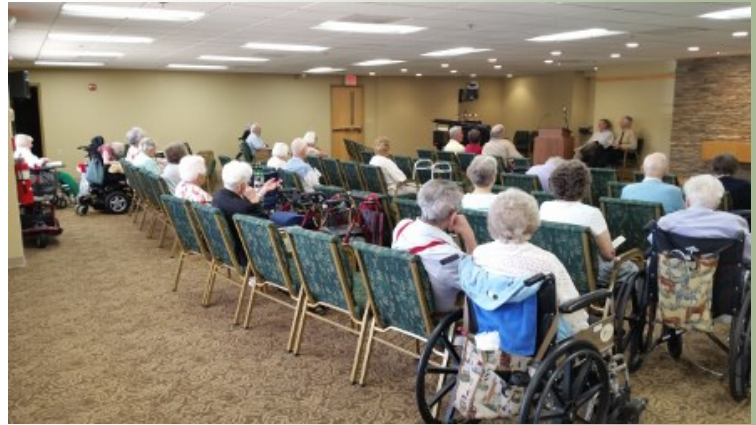
Pittsburg church at the BRC in the new Shuff Spiritual Life Center.