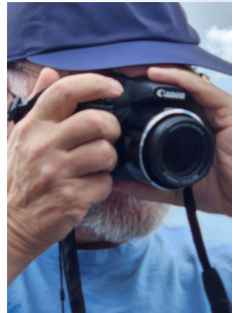
Guess who took the swing pictures below.