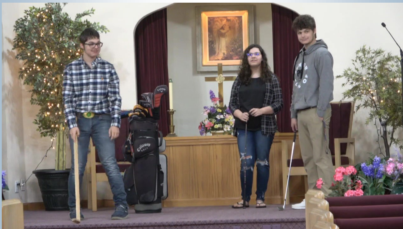
The Pittsburg Players - "Mis-matched" Visit our Facebook or YouTube page, "Pittsburg Church of the Brethren."

If you would like to receive this newsletter by email, please contact the Pastor at pittsburgcob@yahoo.com