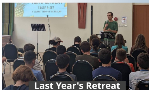
Last Year's Retreat

Picture of hospital visit with our one of translators. Our main purpose to be in Thailand is to help with Bible translation training. Our part includes finding housing, securing funding/visas, helping to care for various medical needs, etc. The later has been the focus the last couple of weeks. Gallstone surgery, suspected typhoid, and influenza are some of the current complications. Pray for good networking with the doctors and healing for our translation students who are suffering.